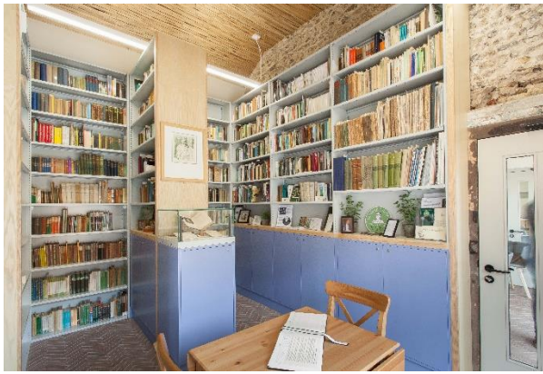
Edward Thomas Study Centre 'library'